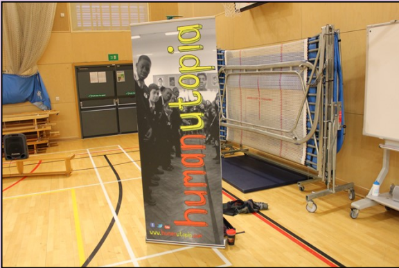
Year ten attended the Who am I? day:

Key stage 4 students enjoyed whole day workshops by humanutopia, an educational organisation that runs inspirational, life-changing course for young people.