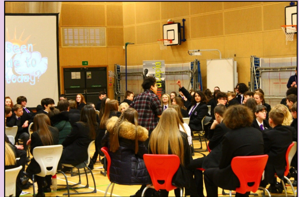
Whilst year 11's focus was on The Final Push :